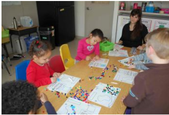
Finding Area and Perimeter