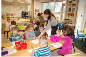
Identifying La Comida in Spanish