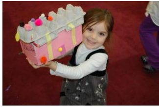
Making Composite Shapes with Tangrams